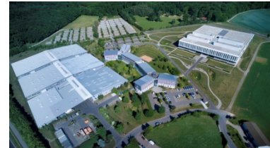
WITTENSTEIN SE headquarters in Igersheim-Harthausen

In 1999, the Group is able to celebrate yet another topping-out ceremony – in only three years, floor space in Harthausen is more than doubled with the erection of a development and sales centre, a training and communication centre, a second production and assembly shop and a new logistics hall.