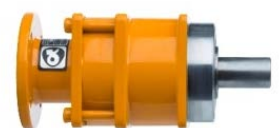
Unveiled at the Hanover Fair back in 1983: the first SP low-backlash planetary gearhead