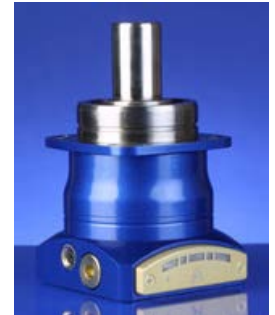
A vision of the nineties, realized in 2003: the intelligent alpheno® IQ gearhead

On September 29, 2016 the name of WITTENSTEIN AG changes to WITTENSTEIN SE and the company is henceforth operated as a European Company.