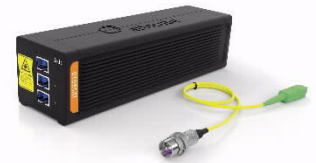
Optical sensor IDS3010 for measurement in the nano range