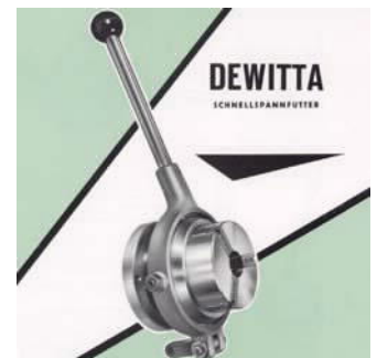
DEWITTA quick-release chuck