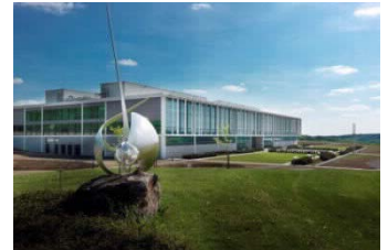
The WITTENSTEIN Innovation Factory is officially opened in May 2014 in Igersheim-Harthausen.