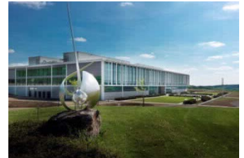
The WITTENSTEIN Innovation Factory is officially opened in May 2014 in Igersheim-Harhausen.