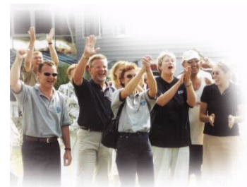
Now and then: the company's most important capital are the people who work for it