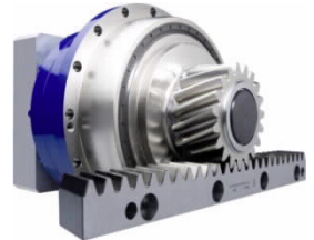
TPM+ servo actuator with rack and pinion