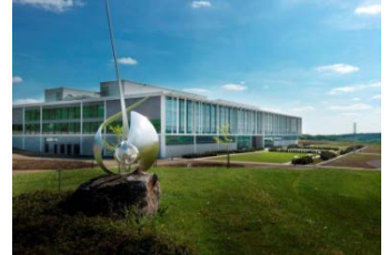
The WITTENSTEIN Innovation Factory is officially opened in May 2014 in Igersheim-Harthausen.