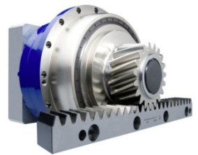
TPM* servo actuator with rack and pinion