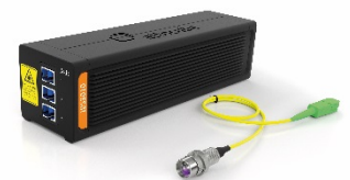
Optical sensor IDS3010 for measurement in the nano range