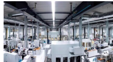
View of WITTENSTEIN bastian's new "Future Urban Production" facility in Fellbach