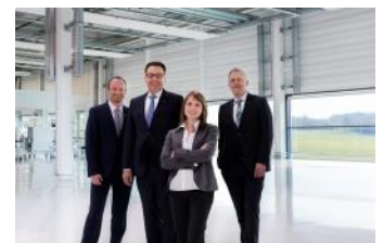
WITTENSTEIN SE Management Board