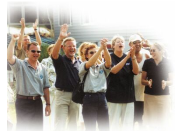
Now and then: the company's most important capital are the people who work for it