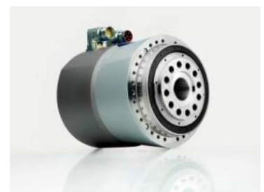
HERMES AWARD 2015