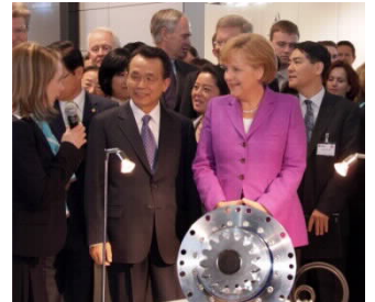
2009: Chancellor Merkel visits the WITTENSTEIN booth at the Hanover Fair