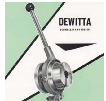
DEWITTA quick-release chuck