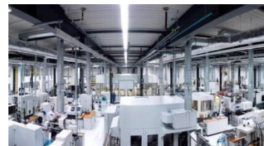
View of WITTENSTEIN bastian's new "Future Urban Production" facility in Fellbach