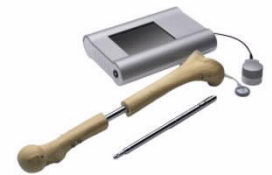
WITTENSTEIN intens FITBONE® for lengthening human limbs

Products made by the WITTENSTEIN Group's seven Business Units are typically used in robotic systems, machine tools, packaging, conveyor systems and process technology, paper and printing presses, medical technology and stage and lifting technology. Parallel to this, niche markets such as the aerospace industry, drive technologies in or on the human body and offshore extraction of natural gas and oil under the ice sheet of the Norwegian Sea are systematically targeted.