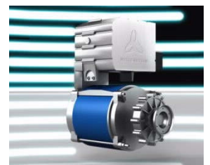
A vision for the future: highly compact electric drive system