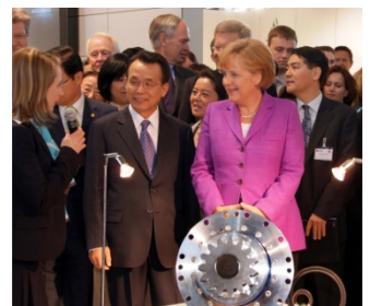
2009: Chancellor Merkel visits the WITTENSTEIN booth at the Hanover Fair