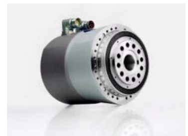
HERMES AWARD 2015