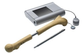
WITTENSTEIN intens FITBONE® for lengthening human limbs

Products made by the WITTENSTEIN Group's seven Business Units are typically used in robotic systems, machine tools, packaging, conveyor systems and process technology, paper and printing presses, medical technology and stage and lifting technology. Parallel to this, niche markets such as the aerospace industry, drive technologies in or on the human body and offshore extraction of natural gas and oil under the ice sheet of the Norwegian Sea are systematically targeted.