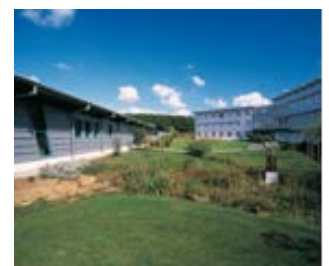
WITTENSTEIN SE World Garden in Igersheim-Harthausen