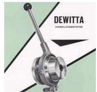
DEWITTA quick-release chuck