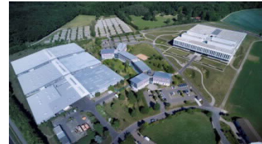
WITTENSTEIN SE headquarters in Igersheim-Harthausen

In 1999, the Group is able to celebrate yet another topping-out ceremony – in only three years, floor space in Harthausen is more than doubled with the erection of a development and sales centre, a training and communication centre, a second production and assembly shop and a new logistics hall.