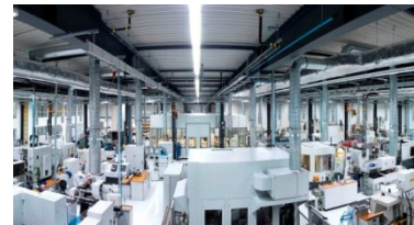
View of WITTENSTEIN bastian's new "Future Urban Production" facility in Fellbach